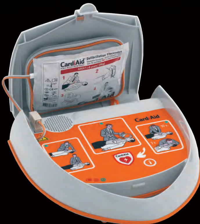
Public Access Defibrillator